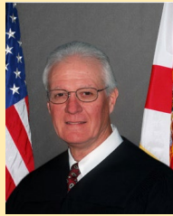
Honorable Judge Donald G. Jacobsen 10th Judicial Circuit Court